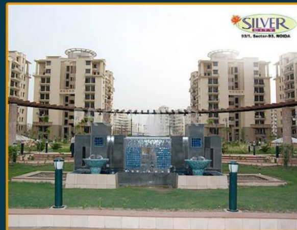
Purvanchal Silver City (Sec-93, Noida)