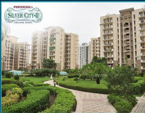
Purvanchal Silver City II (Gr. Noida)