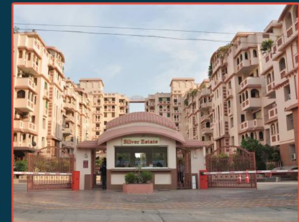
Purvanchal Silver Estate (Sec-50, Noida)

Disclaimer:- This contains Artistic Impression and no warranty is expressly or impliedly given that the completed development will comply in any degree with such artist's impression as depicted. This is not an offer, an invitation to offer and/or commitment of any nature. The furniture, accessories, paintings, items, electronic goods, additional fittings/fixtures, decorative items, false ceiling including shades, sizing and color of the tiles etc. in the image are only indicative in nature and do not form part of the standard specifications/amenities/services to be provided in the unit. All specifications and terms shall be as per the final agreement between the parties. The distances/estimated time of drive mentioned in the brochure is indicative/tentative. T&C apply.